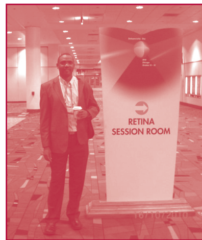
Attending Retina session at Academy, Chicago