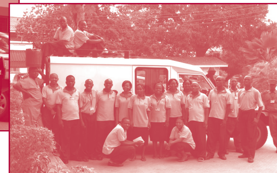
Some of the Lighthouse staff thanking our generous donor